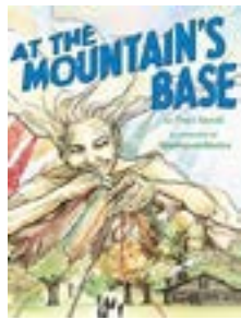
At the Mountain's Base by Traci Sorell https://youtu.be/fnNoyNNhDkg