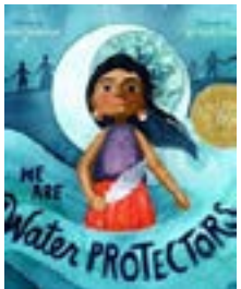
We Are Water Protectors by Carole Lindstrom https://youtu.be/7YviSkDv9xU